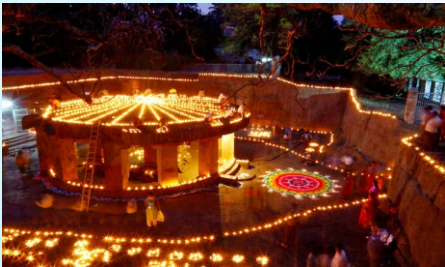
Pataleshwar Cave Temple