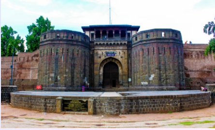
Shaniwar Wada Palace