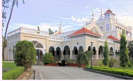
Aga Khan Palace