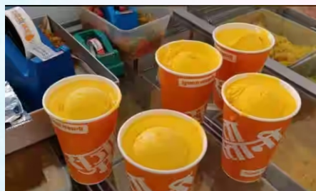
Mango Mastani at Sujata Mastani