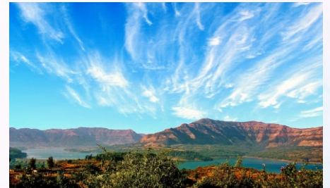
Mulshi Lake and Dam