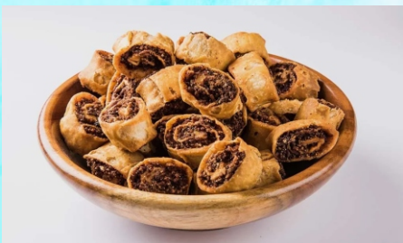
Bhakarwadi at Chitale Bandhu