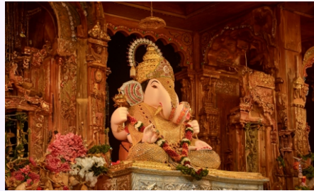
Dagdusheth Halwai Temple