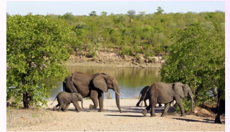
Rajiv Gandhi Zoological Park