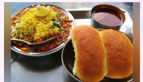
Misal Pav at Kata Kirr